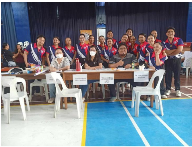
SHANS Students with volunteer doctors