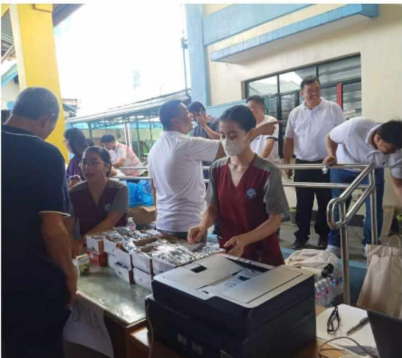
Pharmacy students in action (Counseling and Dispensing)