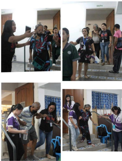
Arrival of elderly recipients assisted by SHANS faculty and students