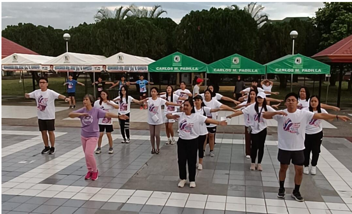
Warm up through a Zumba dance