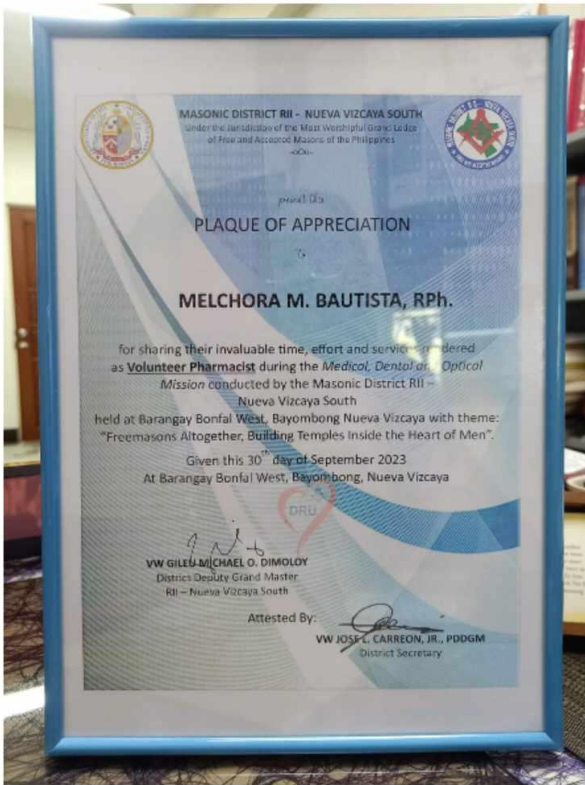
Awarding of Plaques of Appreciation to SMU and participants