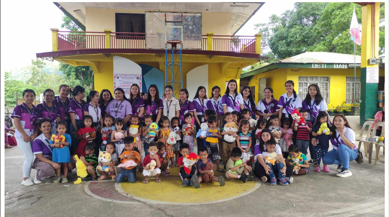
Photo ops of SMU and PLT Pharmacy students with the recipients