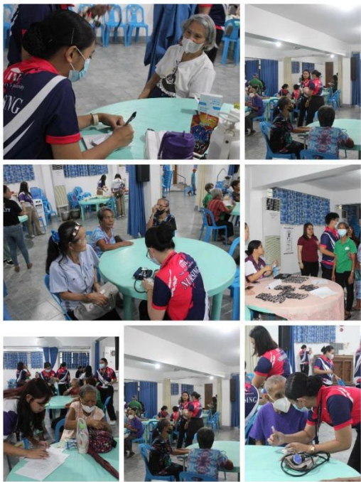
Assessment of elderly recipients by volunteer nurses and students