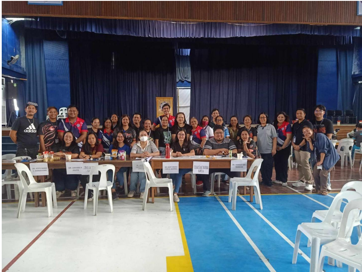
SHANS Faculty and volunteer doctors