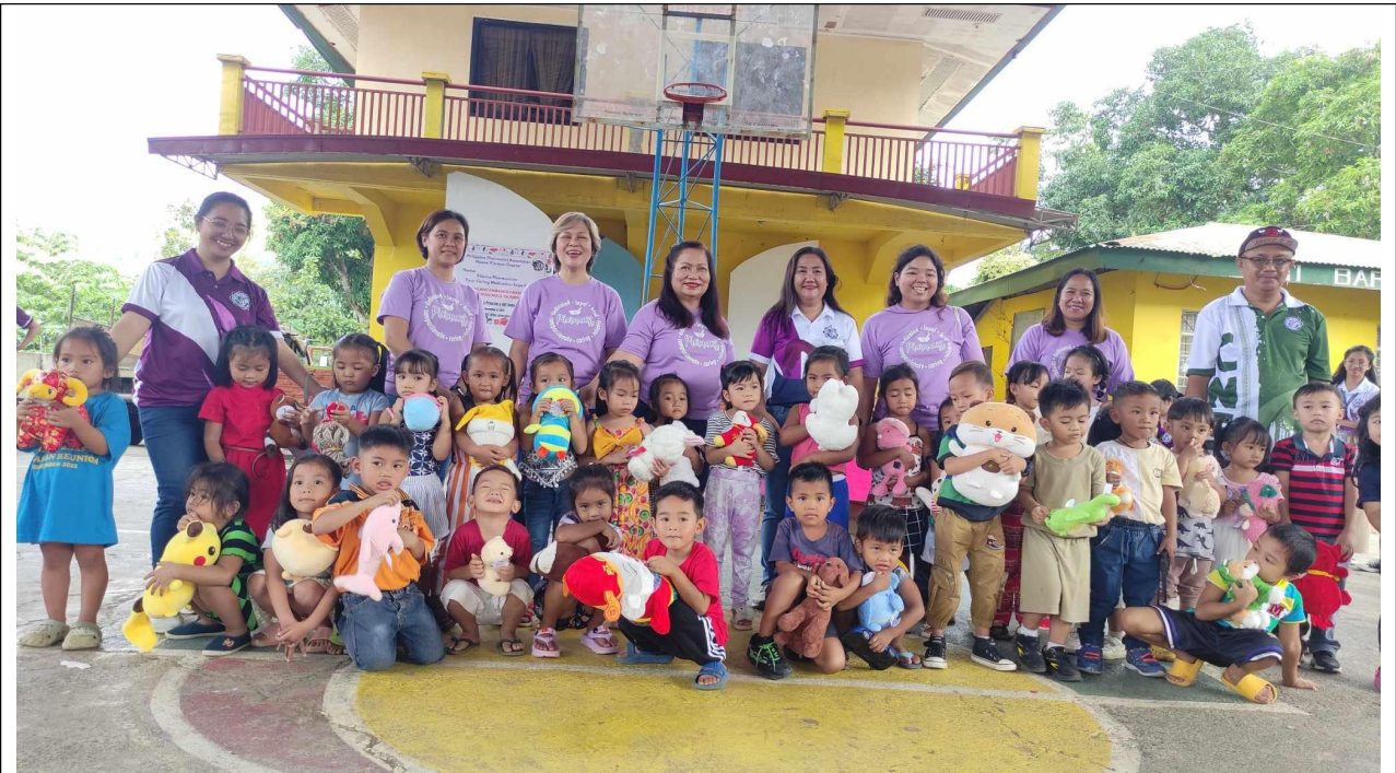
Photo ops of the participants from SMU faculty and NVPHA officers with the recipients