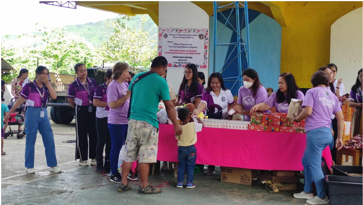
Distribution of vitamins, stuffed toys and gifts