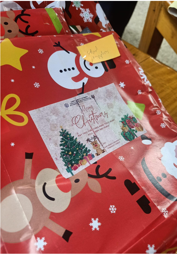
Wrapped game prizes donated by the Pharmacy senior students