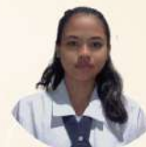
BARBIÉN BALUT BSED ENGLISH 3