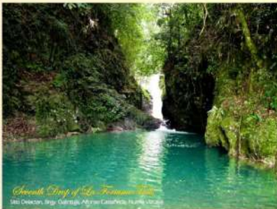
Galitaja Falls, situated in the scenic Alfonso Castaneda region of Nueva Vizcaya, Philippines

SDG 7, aims to ensure universal access to affordable, reliable, and sustainable energy sources. It seeks to improve energy efficiency, promote clean and renewable energy, and address energy poverty to support both economic development and environmental sustainability.